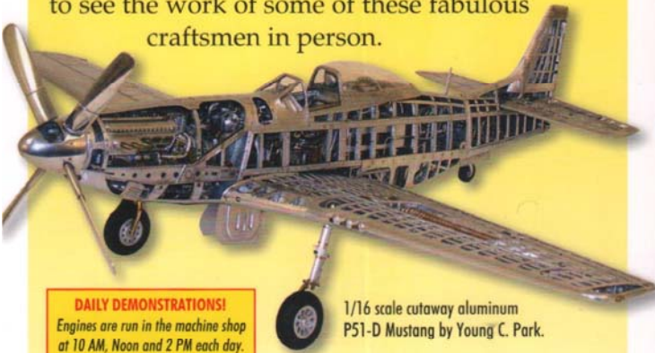
1/16 scale cutaway aluminum P-51-D Mustang by Young C. Park.

The Joe Martin Foundation for Exceptional Craftsmanship hosts an online museum at www.CraftsmanshipMuseum.com . Now there is also a physical museum where you can come to see the work of some of these fabulous craftsmen in person.