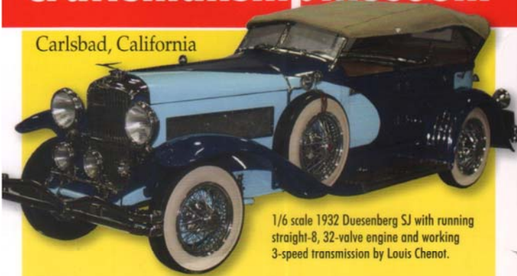
1/6 scale 1932 Duesenberg SJ with running straight-8, 32-valve engine and working 3-speed transmission by Louis Chenot.

The Joe Martin Foundation for Exceptional Craftsmanship hosts an online museum at www.CraftsmanshipMuseum.com . Now there is also a physical museum where you can come to see the work of some of these fabulous craftsmen in person.